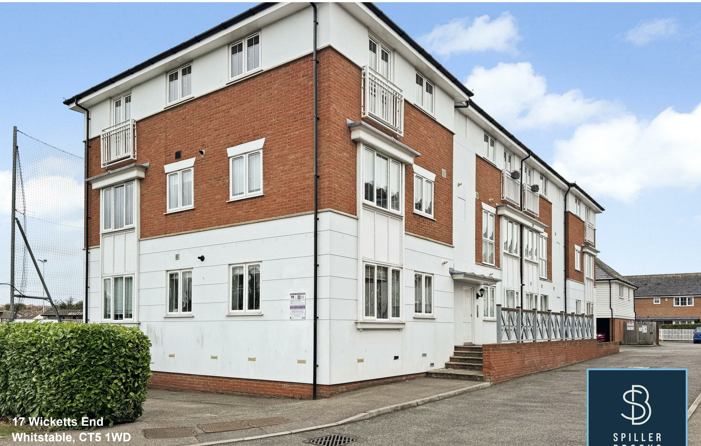
17 Wicketts End Whitstable, CT5 1WD